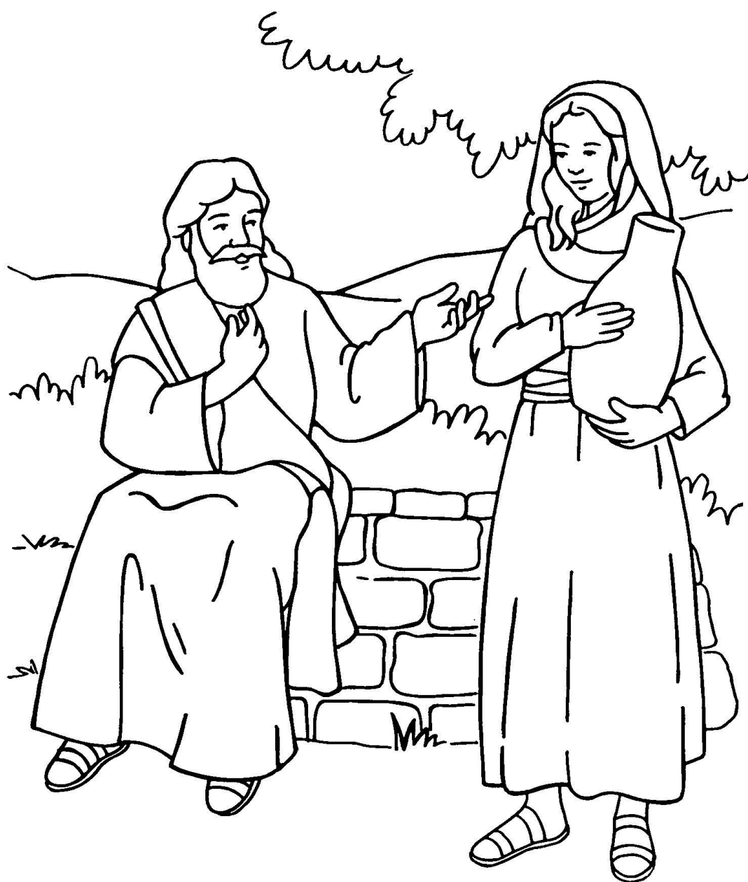
Jesus and the Samaritan Woman

Colour in Jesus talking to the Samaritan woman.